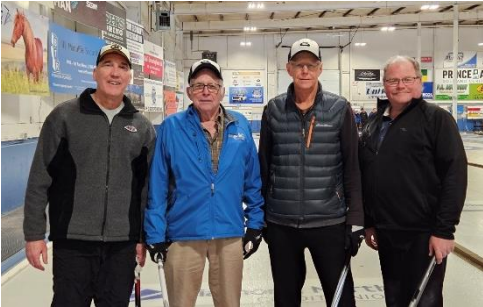
13 teams competed in the Senior Skins Spiel.